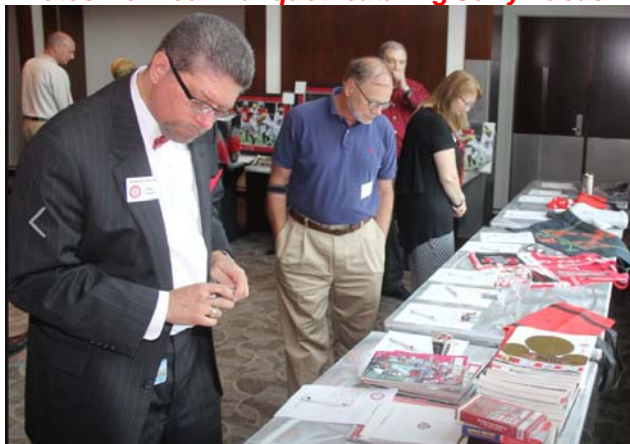
Participants checking out the Silent Auction goods.