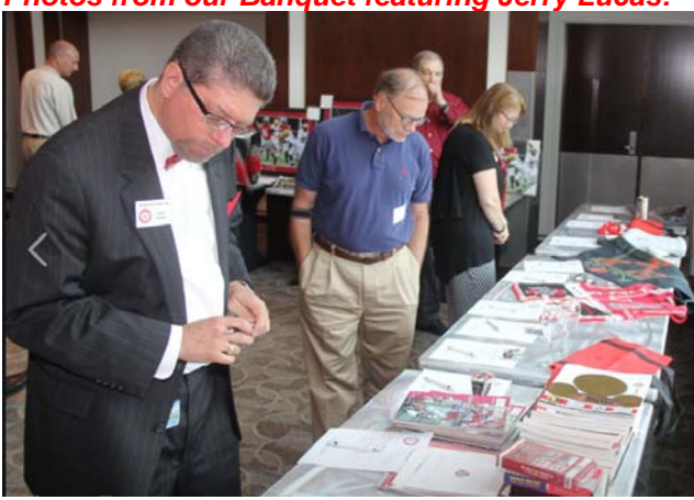
Participants checking out the Silent Auction goods.

Photos from our Banquet featuring Jerry Lucas: